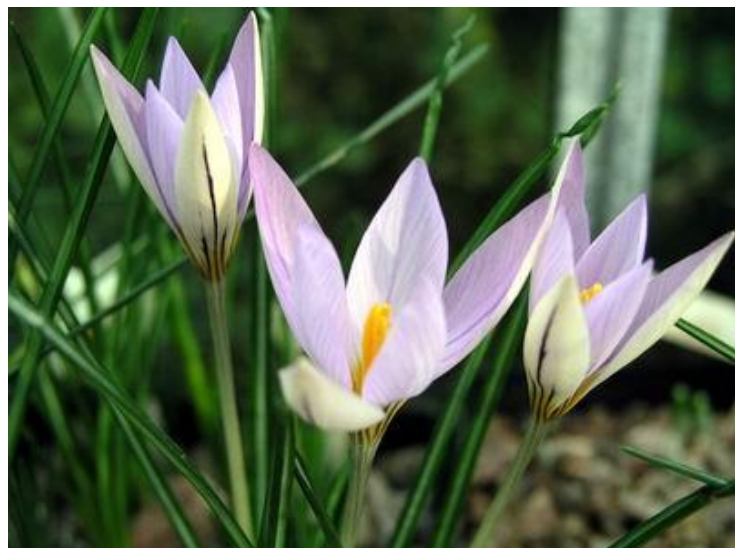
Crocus imperati suaveolens .