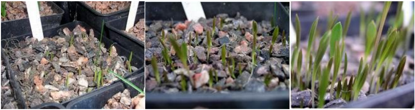
Frit. stenantha seedlings.

This is the same pot of Fritillaria stenantha seedlings, photographed over the last three weeks to show the rate of growth that the seedlings make. They were sown in October 2002 and germinated last year so this is their second year of growth, which, as you can see, has progressed from only just showing three weeks ago, to having quite well-developed leaves this week.