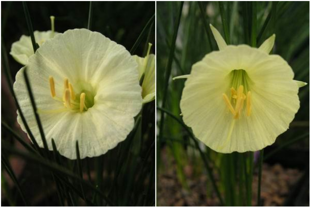
Narcissus romieuxii x2.