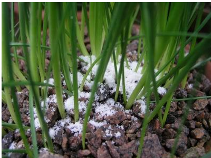
Potash on the pots

A good teaspoonful is sprinkled onto the surface of each pot just before I water them.