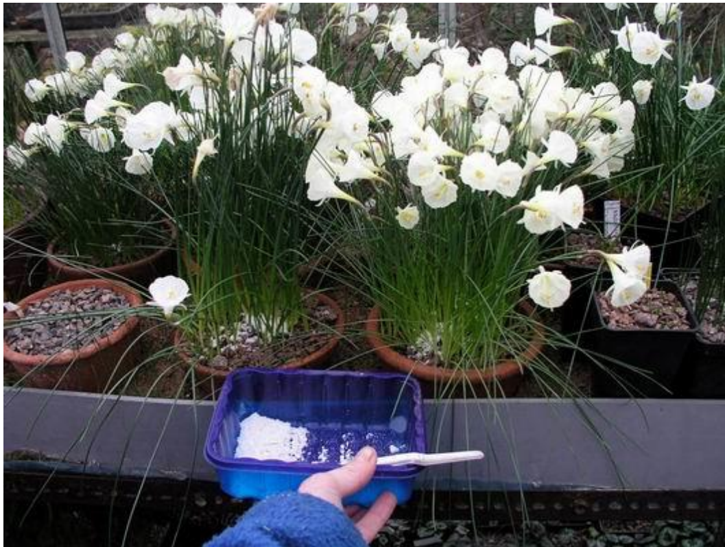
Applying Sulphate of potash.

This is the same pot of Fritillaria stenantha seedlings, photographed over the last three weeks to show the rate of growth that the seedlings make. They were sown in October 2002 and germinated last year so this is their second year of growth, which, as you can see, has progressed from only just showing three weeks ago, to having quite well-developed leaves this week.